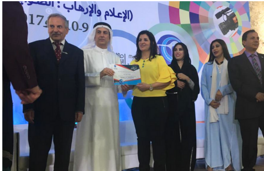
University of Gezira