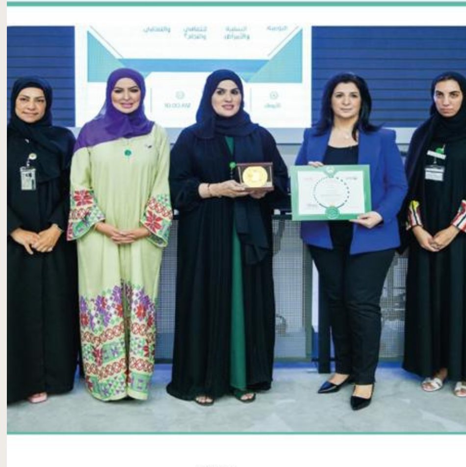
Emotional Intelligence Seminar at Dubai Police