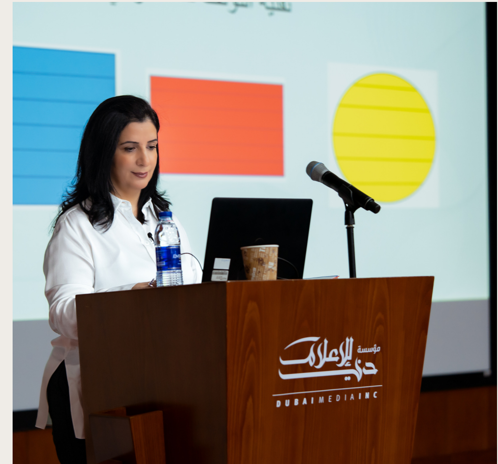
Emotional Intelligence Course in Dubai Media Incorporated