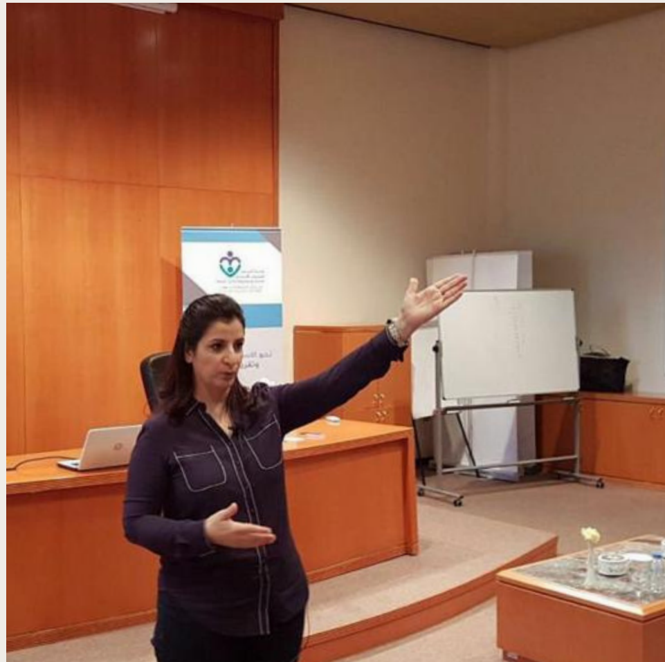
Dubai Silicone Oasis authority RTA