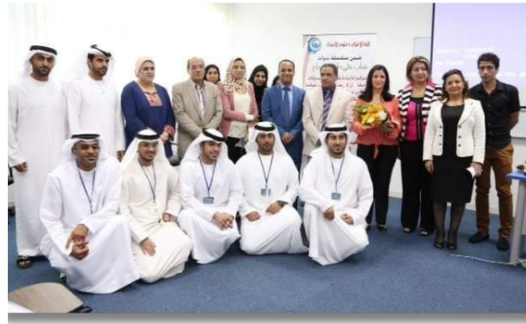
Autism Center Sharjah